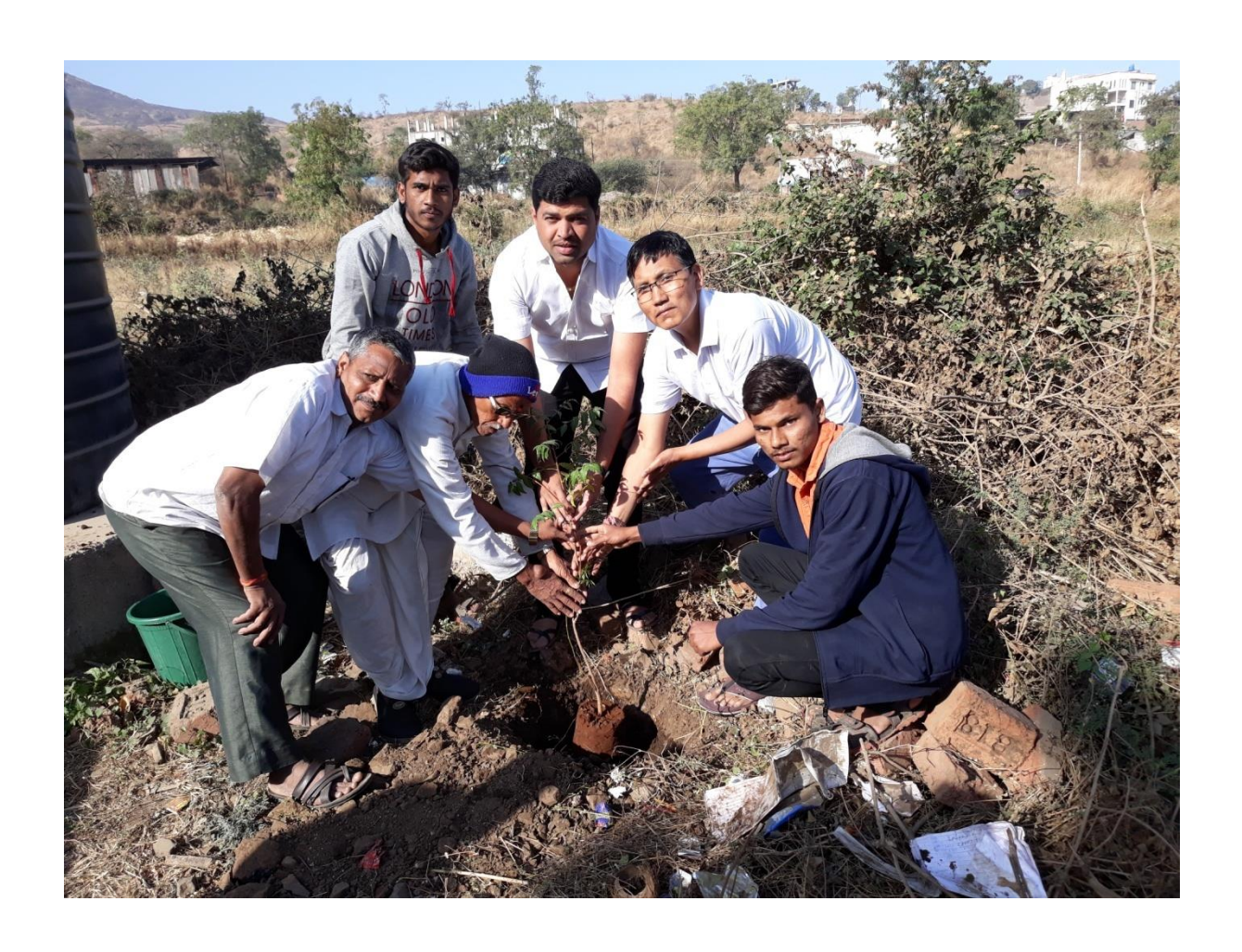
Tree plantation at Z. P. School Gujar-Nimbalkarwadi