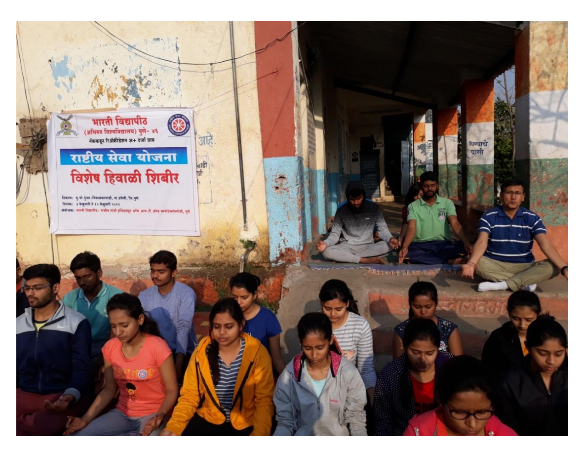
Daily yoga at NSS Camp