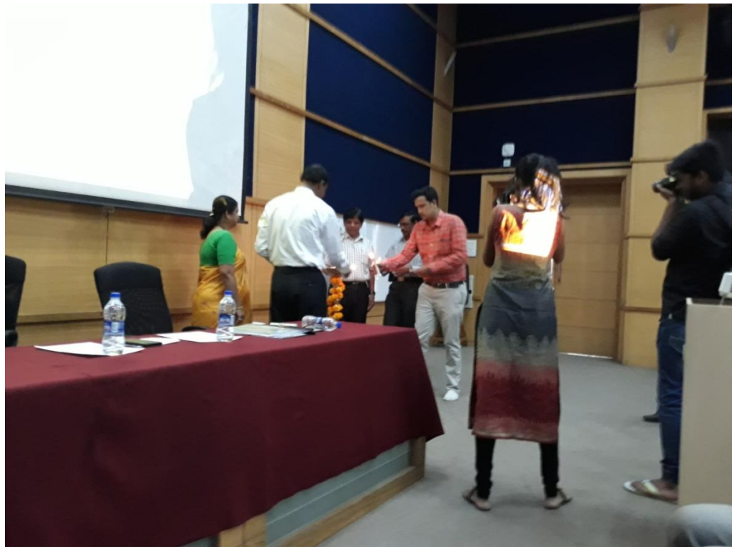
Inauguration of Yuva Mahiti Doot on 2<sup>nd</sup> Nov.2018