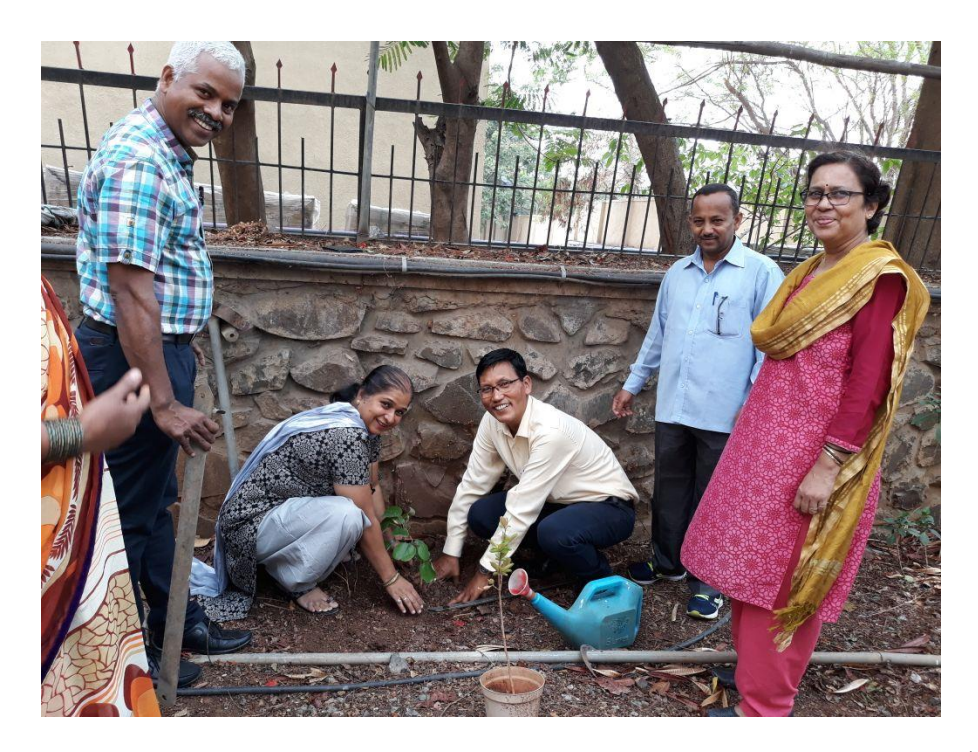
Tree Plantation on occasion of World Environment Day at Herbal Garden on 5<sup>th</sup> June 2018