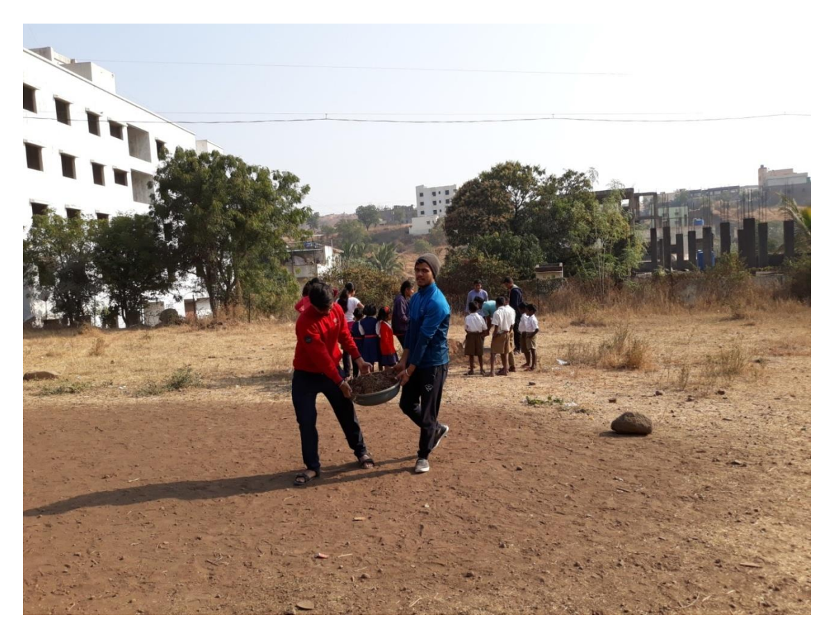
Cleanliness at Village