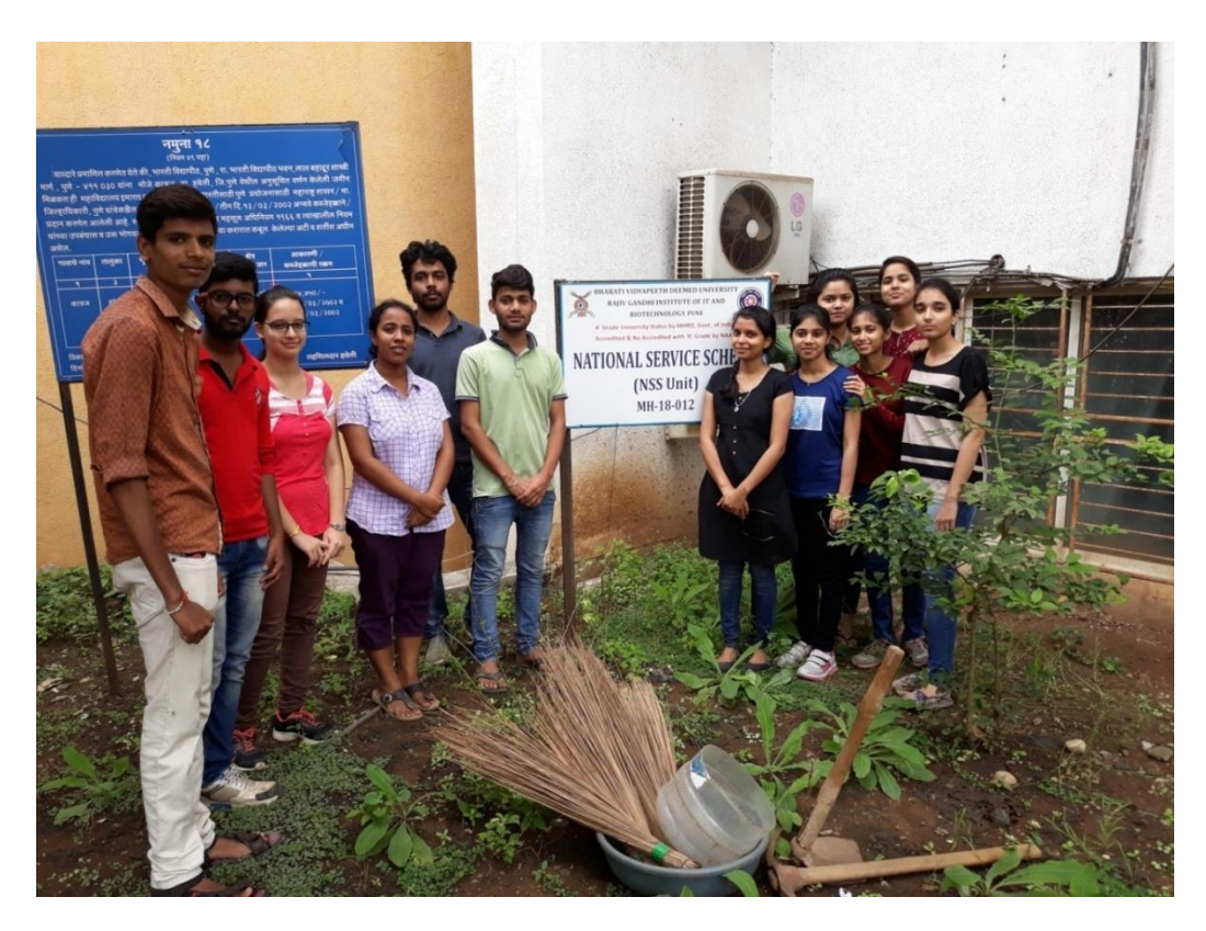
Cleanliness programme on Gandhi Jayenti 2^{nd} Oct. 2018