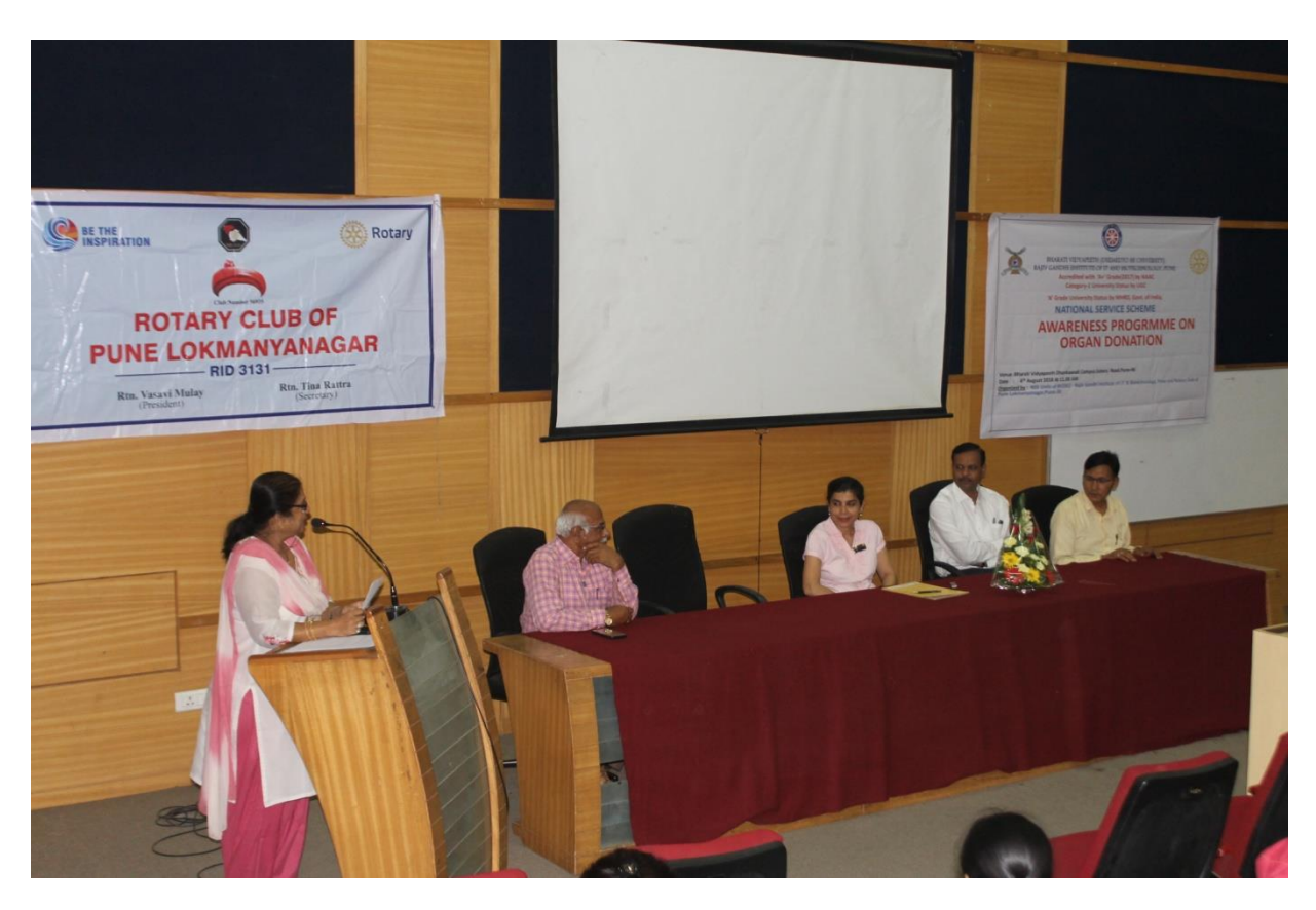
Awareness Programme on Organ Donation On 4<sup>th</sup> August 2018