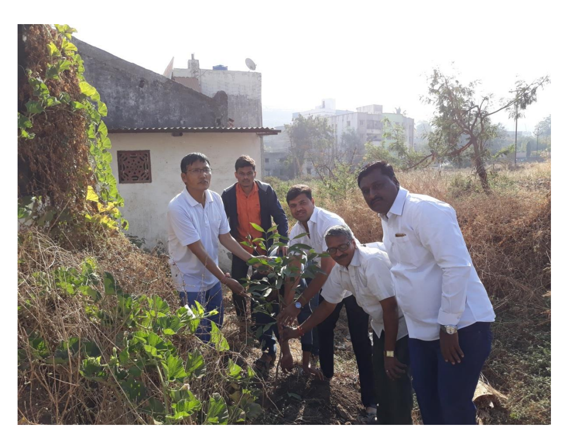
Tree plantation at Gram-Panchayat Area