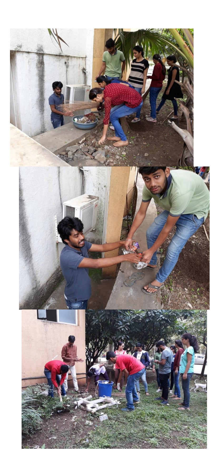
College campus cleanliness