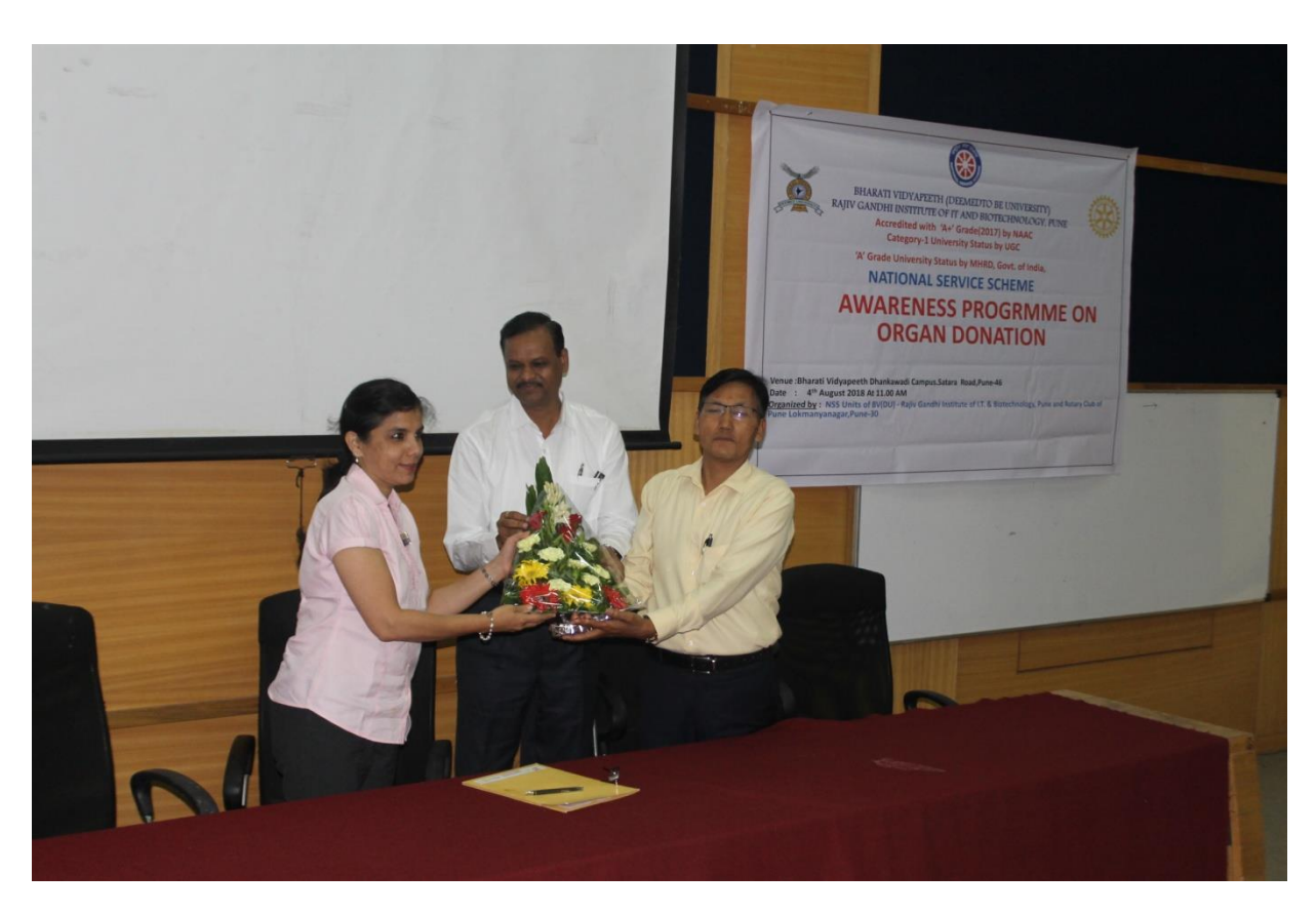
Awareness Programme on Organ Donation On 4th August 2018