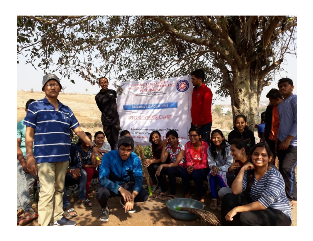
Cleanliness at Village Temple area