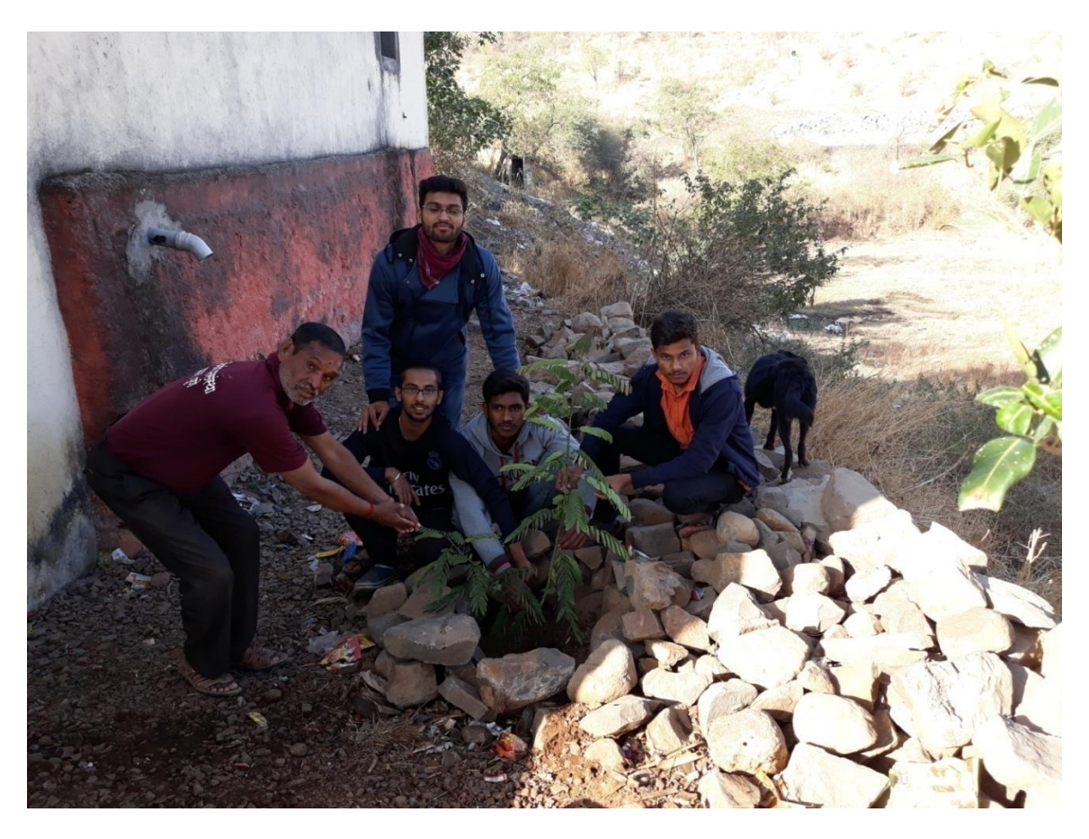
Tree plantation near Vithal Temple at Gujarwadi