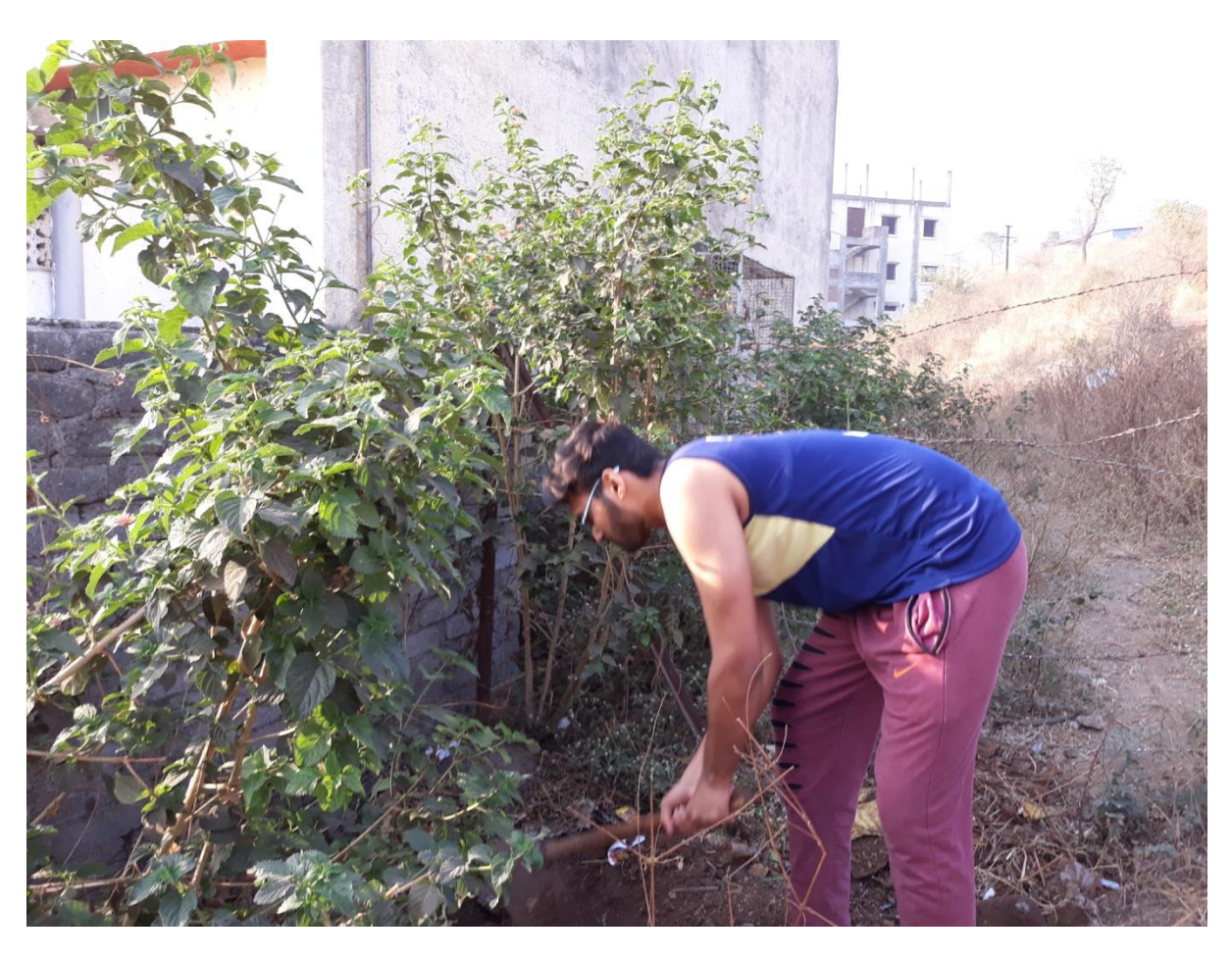
Preparation for Vermicompost pit at Village