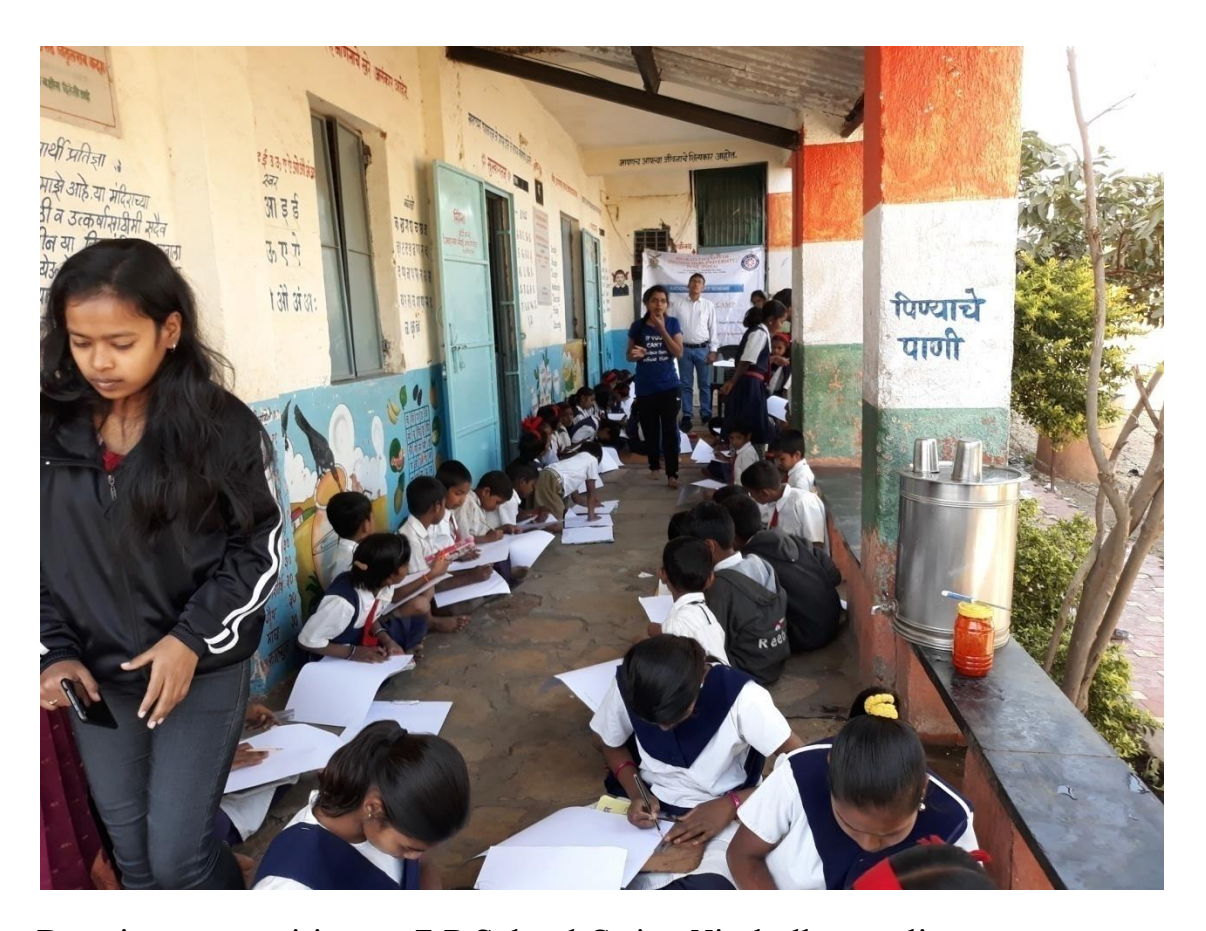
Drawing competition at Z.P.School Gujar-Nimbalkarwadi