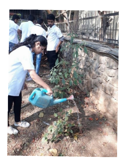
Tree Plantation on occasion of World Environment Day at Herbal Garden on 5<sup>th</sup> June 2018