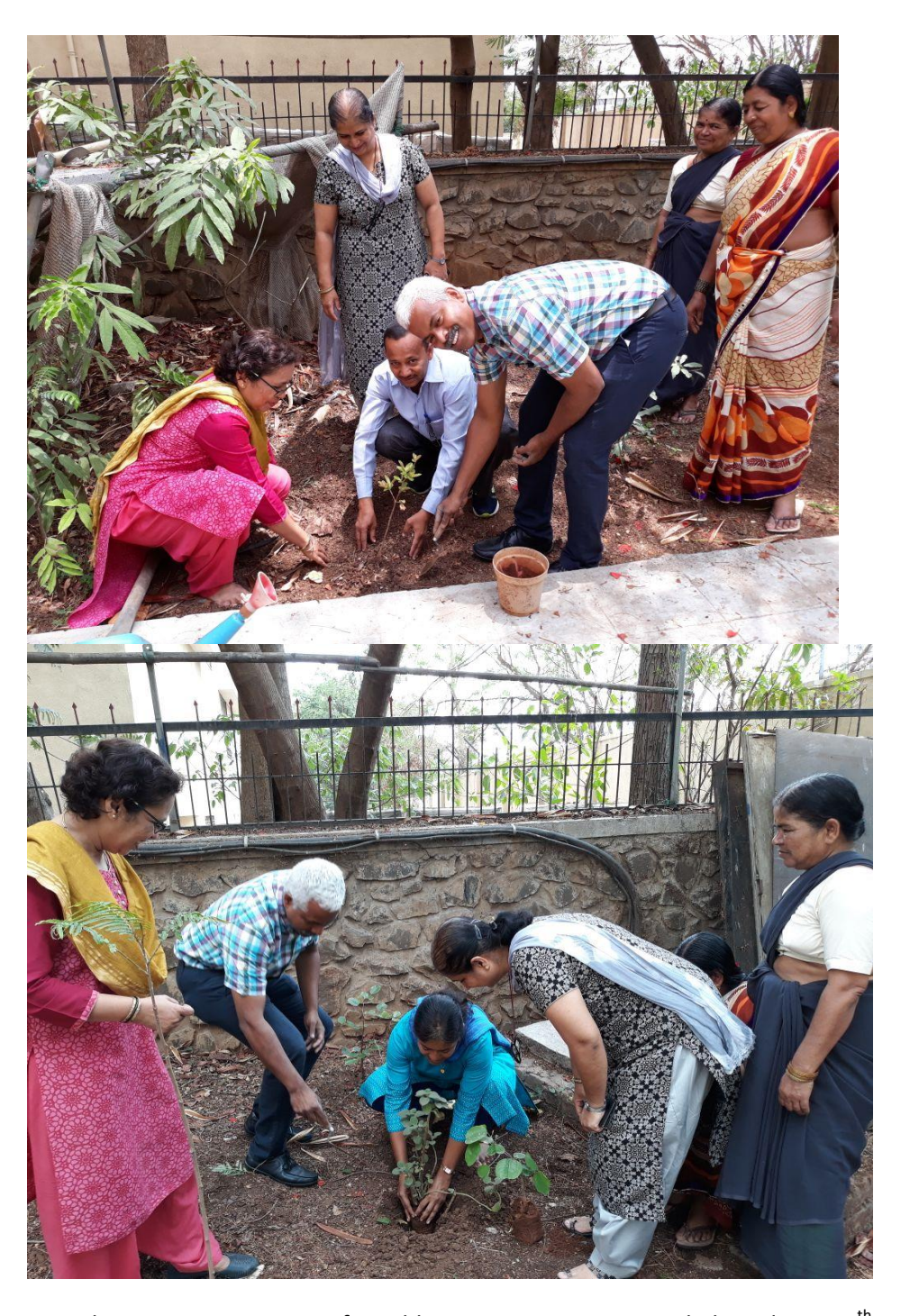
Tree Plantation on occasion of World Environment Day at Herbal Garden on 5^{\text{th}} June 2018