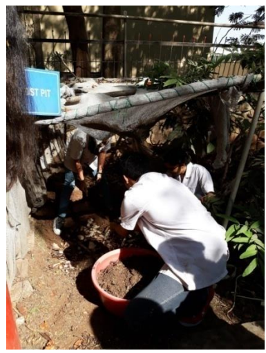
Preparations of Vermicompost pit at Herbal Garden